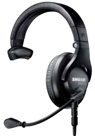
BRH441M Single-Sided Broadcast Headset