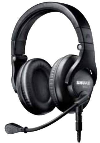
BRH440M Dual-Sided Broadcast Headset